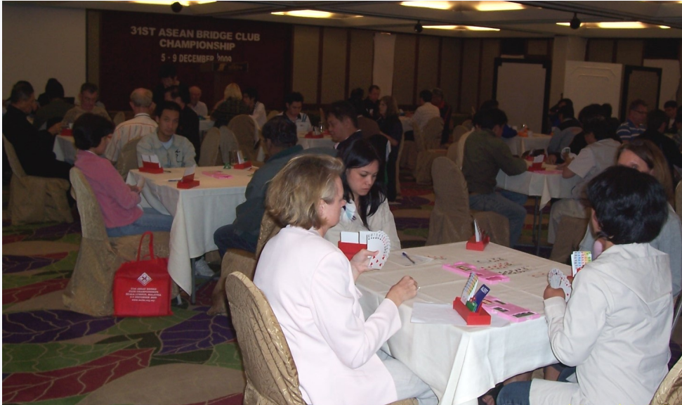
View of the Closed Room